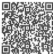
Android for outside China

Apple mobile phones search "DayDay Band" in the Apple store, to download and install the watch APP; Android mobile phones search "DayDay Band" in the Google Play store or 360 phone assistant, Baidu phone assistant etc. in China. Also can scanning QR code as follows, and then download and install client APP/APK software for watch.