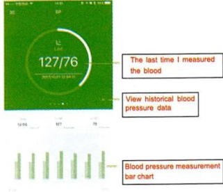
e. Bp interface: