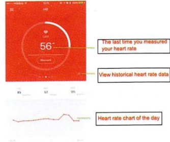
d. Heart Rate interface: