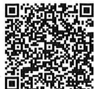
APP for GooglePlay

Thanks for your purchasing and using our smart wristband, you can read the manual to fully know the function of the wristband and simple method of operation.